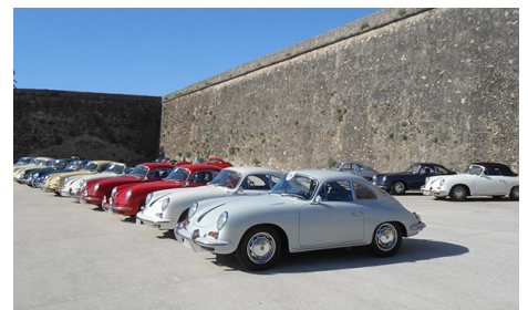
2000: Club Porsche 356 España hosted the 356 INT Meeting in 2016

In Spain, fans of the classic Porsche 356 models come together in the Club Porsche 356 España .