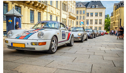
1999: Porsche Classic Club Luxembourg Classic Meeting in 2017

The 911 GT3 R for international GT Sport debuts in June 1999 with a class victory in Le Mans, a feat repeated in 2000. In the American Le Mans Series the 911 GT3 R remains unbeaten, save for one race, for 2 years and twice in a row wins all GT titles of this international championship.