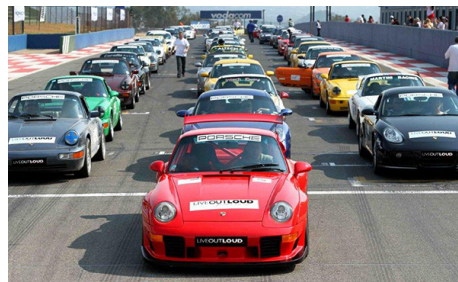
2001: Porsche Parade South Africa

For the 2001 season, Porsche Motorsport creates a significantly modified 911 GT3 Cup for use in one-make racing series. The 911 GT3 RS is available for international GT sport. The Porsche 911 GT2 introduced in Detroit is the most powerful production sports car to date from Porsche, with 462 hp.