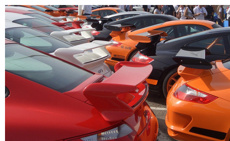
1992: ... well known for the large amount of GT cars