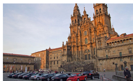
1992: The 1992 founded Porsche Club Portugal on tour

PORSCHE PRESENTS THE FORWARD- THINKING BOXSTER CONCEPT CAR AT THE DETROIT AUTO SHOW.