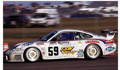
1999: Porsche 911 GT3 R