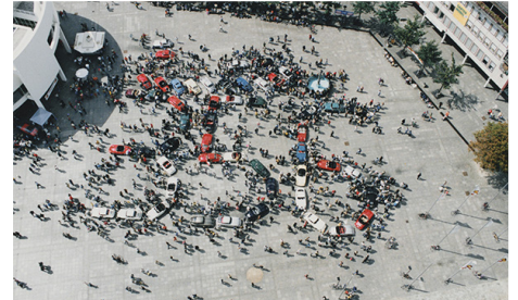
1998: 356 annual meeting in the town of Ulm in 1998