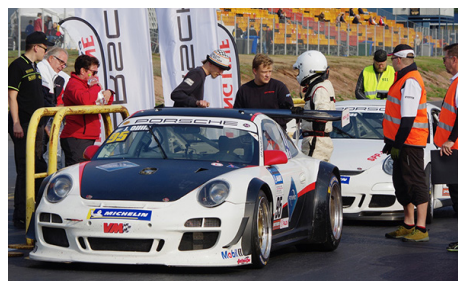
2001: The main event of Porsche Club Finland: Porsche Club Festival Finland