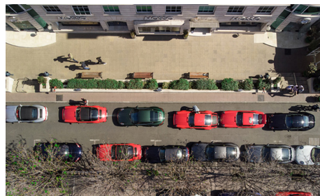
2001: Porsche Club Chile