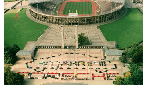
1993: 30 Years of Porsche 911 in Berlin

The Gran Turismo 911 Turbo S Le Mans GT , based on the 911 Turbo S, makes its debut with a class victory at the 12 Hours of Sebring. The Porsche 911 Carrera Type 993 celebrates its premiere at the Frankfurt Motor Show. It will be the last Porsche 911 model to be powered by an air-cooled boxer engine. In addition to this, the Porsche 901 celebrates its 30th anniversary .