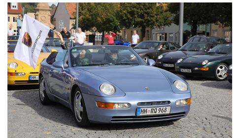
1995: Speedy association: Porsche 968s all lined up

Porsche 968 Club Deutschland: The engine concept and transaxle technology determined the excellent driving characteristics of the 968 and qualified the Porsche model as a unique sports car. The Porsche 968 CS Cup, which had been advertised since 1993, formed the basis of private motorsports.