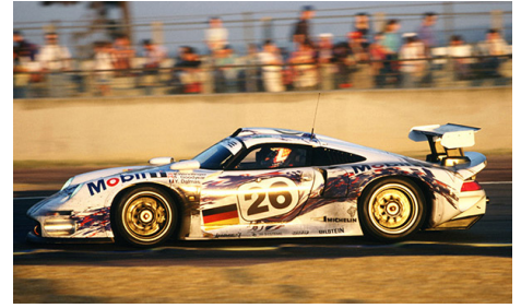
1996: 911 GT1

Right from the start, the newly released Porsche Boxster 986 becomes a great success.