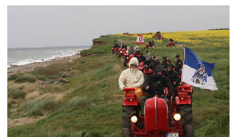
1996: Porsche Diesel Club Europa annual outing

In 1996, seven tractor owners in Bremen founded the Porsche Diesel Schlepper Club Deutschland e.V. , with the aim of "preserving and maintaining Porsche-Diesel tractors, advising on and helping with the restoration of Porsche-Diesel tractors." In the years since, the Club has gained members in Austria, Switzerland, France and Belgium. Responding to international demand, on 26 February 2000 the Club was renamed the Porsche Diesel Club Europa e.V. The Club currently has over 900 members with more than 5,000 tractors in Germany and the rest of Europe.