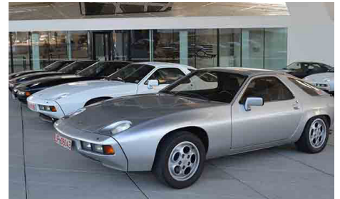
1997: Porsche Club 928 visiting the Porsche Museum