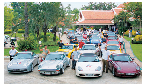
1998: Still growing and expanding: Porsche Club Malaysia