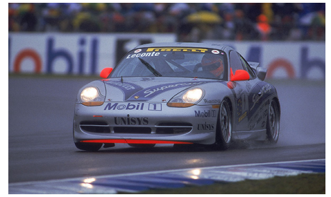
1998: 911 GT3 Cup

On March 27th, Professor Ferry Porsche passes away in Zell am See, at the age of 88.