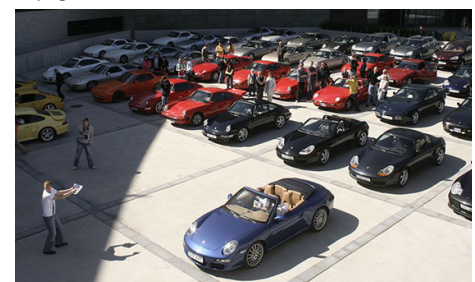
1996: Season opening of Porsche Club Estonia

Porsche Club Estonia is the first Club to be set up in the Baltic states. Porsche Club Estonia stages an annual International Track Day, its field made up almost exclusively of Porsche 911 GT3 models. Until 2004, Club members enjoyed an annual excursion to Uusikaupunki – the Porsche plant there was only 300 km away, while Leipzig was 1,700 km and Zuffenhausen 2,100 km!