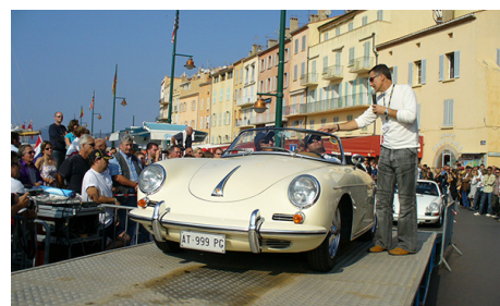
1992: Founded in 1992 the Porsche Club Méditerranée is responsible for the famous Paradis Porsche...