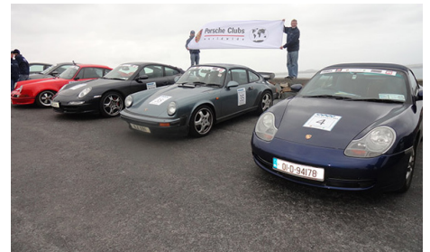
1997: Holding the flag up high: Porsche Club Ireland