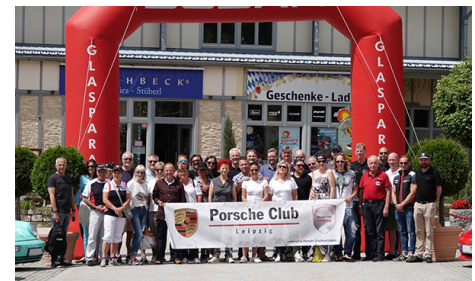
1995: The Club with factory and race track: Porsche Club Leipzig

It was hardly a surprise that in 1995, the year that production was discontinued, efforts were already being made to form an association that felt compelled to carry out the task of maintaining and carrying on the use of the Porsche 968.