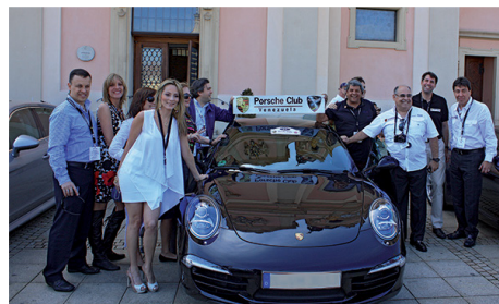
2001: Porsche Club Venezuela 2012 at the anniversary event