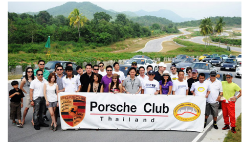
1994: Since 1994 going strong: Porsche Club Thailand

After Hong Kong, Singapore and Japan, a fourth Asian market joins the Club world . Porsche Club Thailand regularly organises Porsche Driving Experience events and Porsche Exclusive Roadshows.