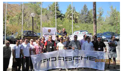
1998: Porsche Club Cyprus in 2010