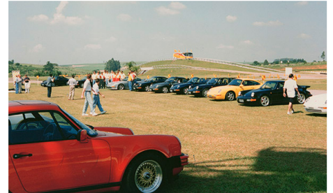
1997: Racing event of Porsche Club do Brasil in the 90s